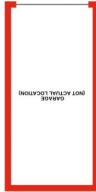
GARAGE 147 sq ft (13.7 sq m) approx.

A professional removal company takes the stress out of moving, knowing that your belongings are safe and insured far outweighs any small savings by trying to do it yourself or using a man-and-a-van service. We work closely with and recommend Cube Removals as the leading local firm. For peace of mind and a reliable service call them on 0800 193 0000 or visit their website, cuberemovals.co.uk , to arrange a survey.